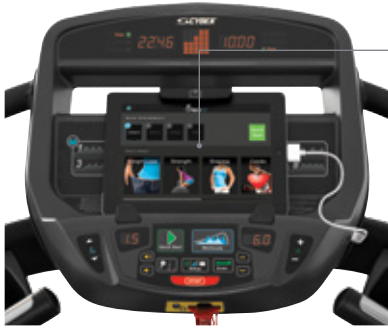
Standard display shown with iPad* and Cybex FIT app

The 525T combines advanced engineering and reliable performance, designed to fit your space and your budget. Built from premium U.S. steel to the highest manufacturing standards, it offers exceptional stability, durability, and value.