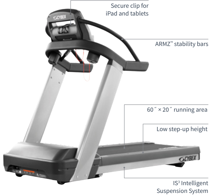
Secure clip for iPad and tablets

The 500 Cardio Series also offers optional technology features including iPod®/iPhone® connectivity, the embedded MYE wireless audio receiver, and the E3 View high definition monitor which offers three viewing modes on a 15.6" embedded display.